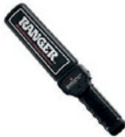
Ranger Handheld Body Scanner Metal Detector