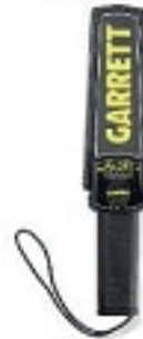
Garrett Super Scanner Handheld Metal Detector