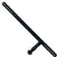
Security baton /rungu